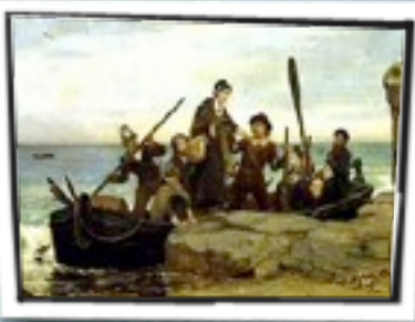
The early pilgrims landing in Plymouth, America.

There was no food, and half of the pilgrims died. The fact that half of them survived was due to the help of the native American Indians.